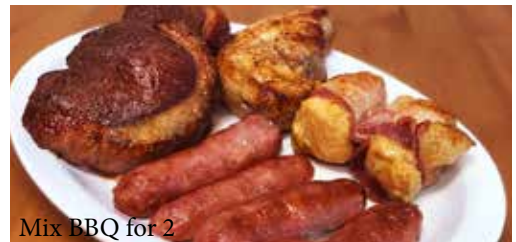
Mix BBQ for 2